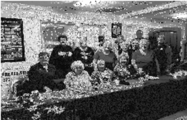
Lost Creek Study Group with a couple Linn County Members.

Lane County held their Christmas Party and some from Linn County were able to attend.